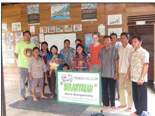
Photo together after Learning Centre inauguration