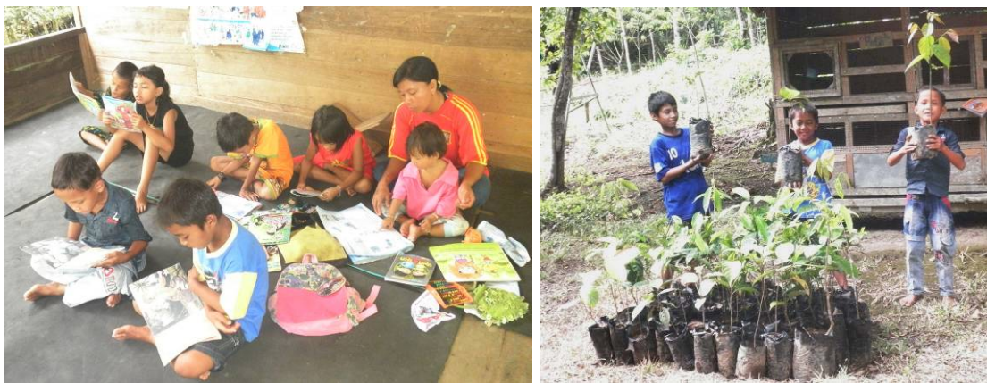
Reading together in Belantikan Learning Centre and the boys assist to planting the tree seedlings