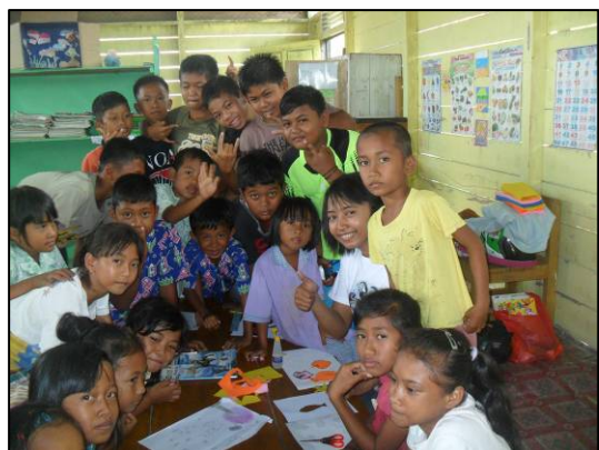
Image above: Learning atmosphere in Terantang Learning Centre and image bellow: Monitoring visits by the Kampung Konservasi librarian