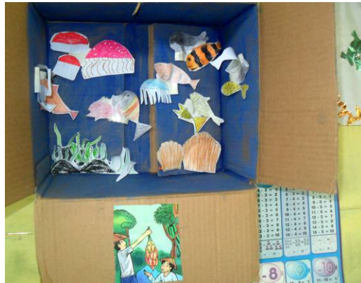
This picture is creative art from reading club members Terantang Learning Centre; Picture in the Top Left : save the forest and Top Right: orangutan and their habitat and the picture below is marine biodiversity