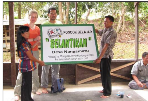
Belantikan Learning Centre inauguration