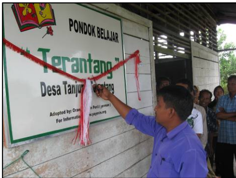
Terantang Learning Centre inauguration

Orangutan in Peril is an organization that since 2010 support to the operational activities learning centre in the villages around the forest where forests become important habitat for orangutans Borneo. Orangutan in Peril has adopted the two learning centre is Terantang Learning in Tanjung Terantang village, South Arut subdistrict, West Kotawaringin district in 2010 and Belantikan Learning Centre in Nanga Matu village, Belantikan Raya subdistrict, Lamandau district in 2012. Both are located in the province of Central Kalimantan.